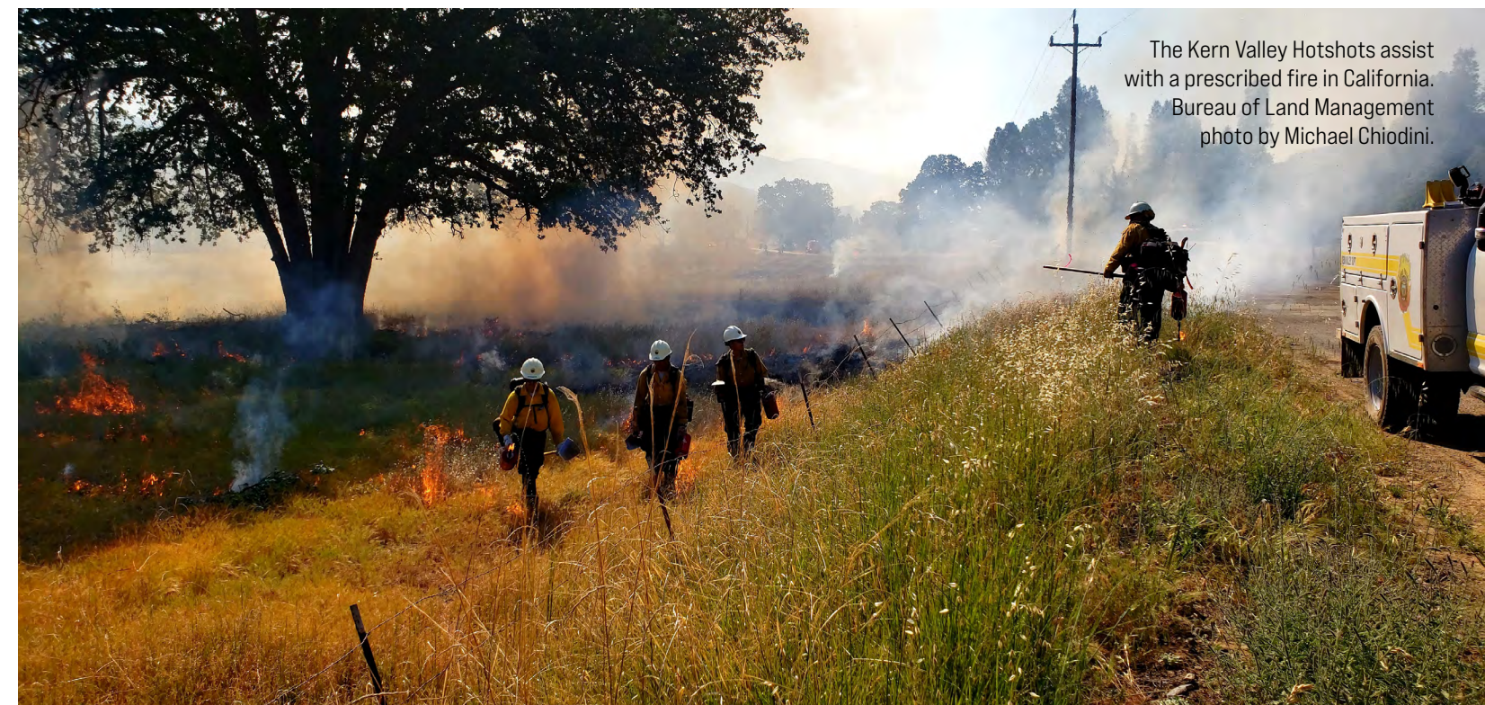
The Kern Valley Hotshots assist with a prescribed fire in California.

For more information and for updated information on roundtables, please visit: www.fs.usda.gov