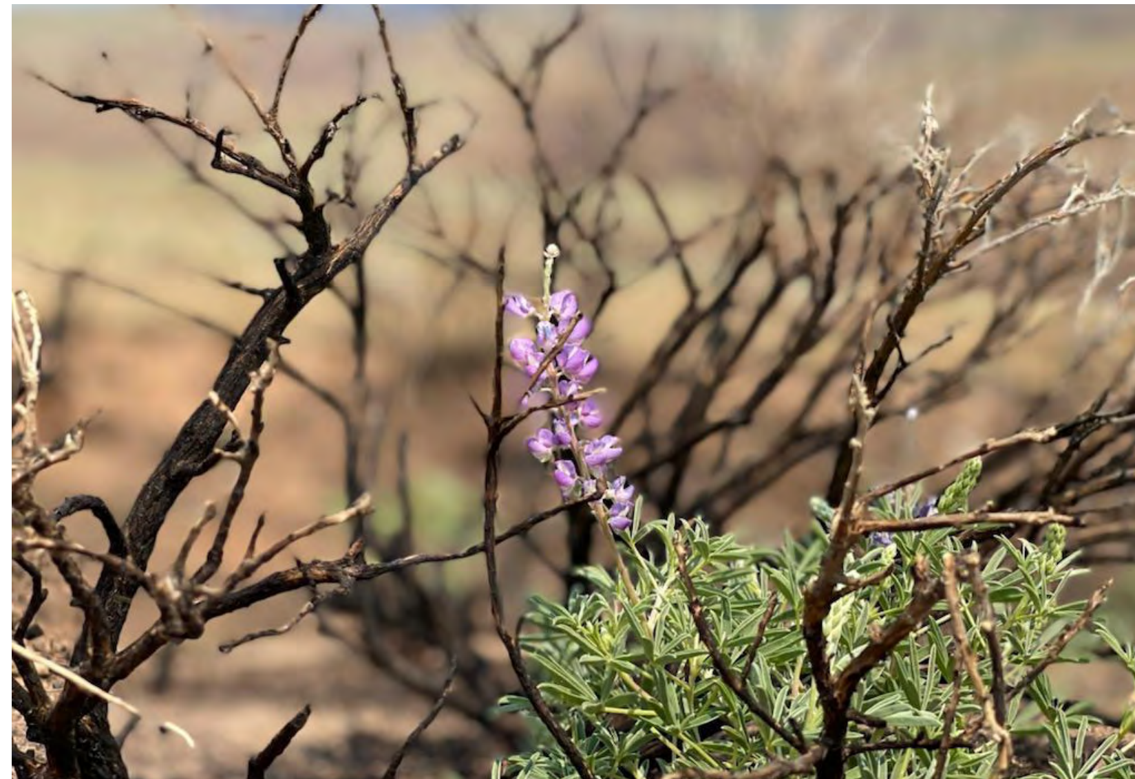
Lupine regenerates after the Robertson Draw Fire near Red Lodge, MT.