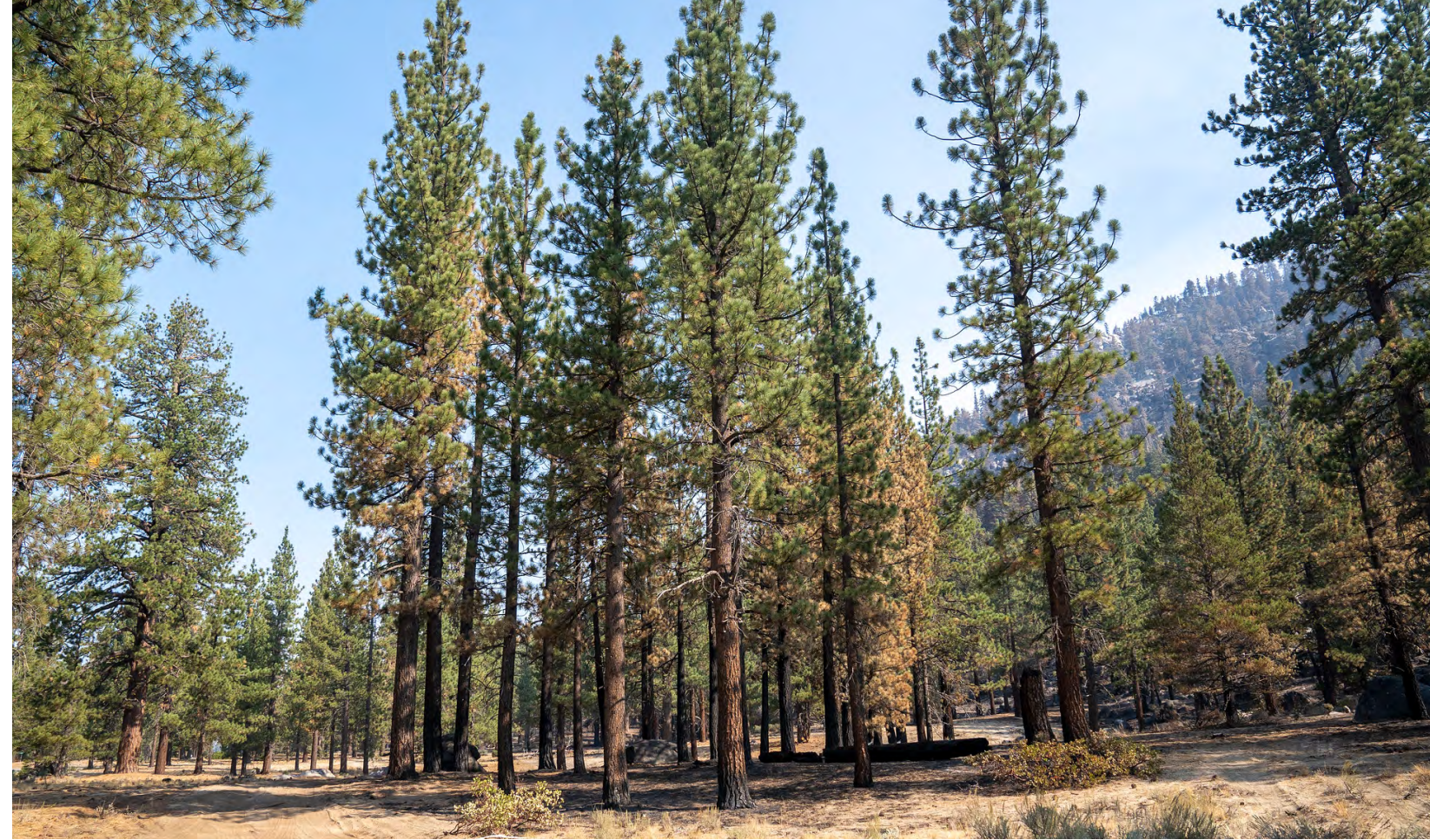
The El Dorado National Forest after the Caldor Fire occurred, showing an area that was treated for fuels near South Lake Tahoe, CA.